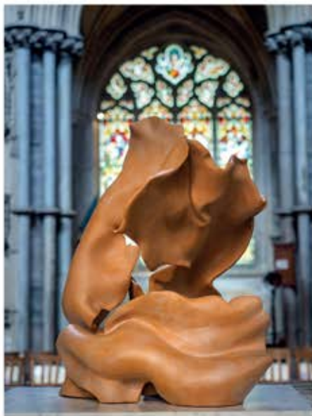
Taking Risks 2016, terracotta. Exhibited at Ely Cathedral, 2018.

The white marble sculptures in the Lobby of One Canada Square are installed in a way that they receive maximum light from the south. Shadow Figures 1990, Struggle 2010, Tree of Life 2010 and Toward the Precipice , Exodus III and Exodus IV , all of 2019, testify to Blumenfeld's increasing skill in carving the finest of white marble. Gradations of translucency range from opacity to near transparency, all of which throw greater focus on form and surface.