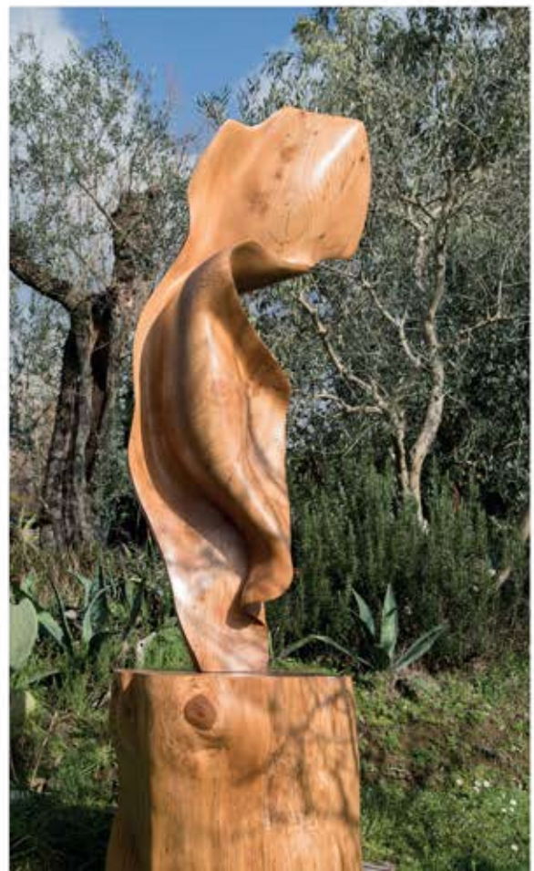
Flight 2019, wood