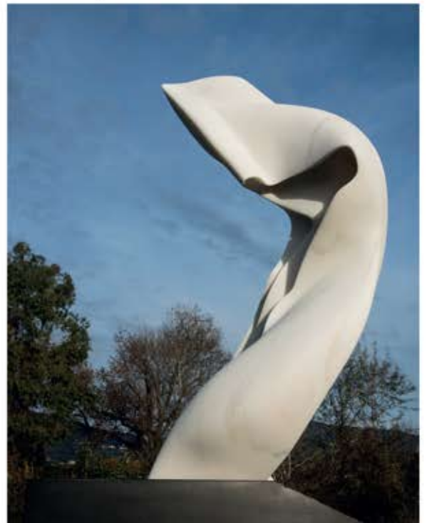
Toward the Precipice 2019, marble.