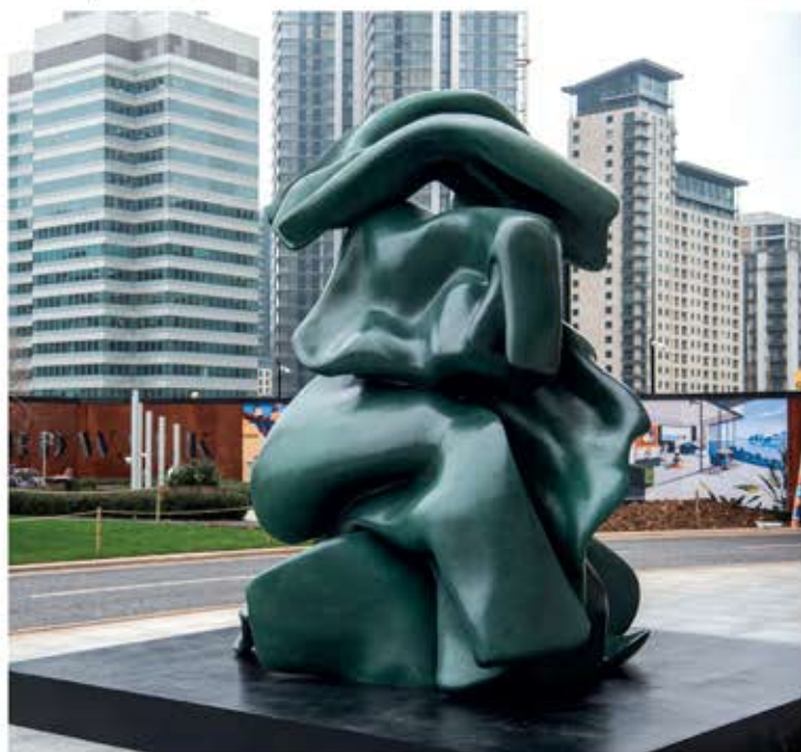
Metamorphosis 2019, bronze. Installed at Wood Wharf.

The selection of sculptures reflects Blumenfeld's wide interest in materials and shows how she persuades the best out of each while maintaining her continually developing vision through intuition, touch and close scrutiny. She explores form initially through making models in clay. Her hands operate as her eyes, working intuitively first and later critically. The subject comes gradually, found through her hands and suggested by the basic form and supplementary, mindful working - drawing on memories from the past, new thoughts and emotions. Blumenfeld likes to feel that she has endless time to work, especially in her Italian studio in Pietrasanta where she can give one hundred percent of her time to working without domestic calls to distract her attention.