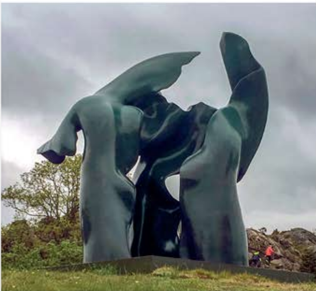
Illusion 2018, bronze

Blumenfeld became more and more aware of the figure – which on one side is full of tension, while on the other has a more figurative aspect. Meridiana 2016 and Taking Risks 2019, show Blumenfeld's growing confidence in carving large forms. Each of the three elements of Taking Risks is made from the same block of marble. The relationships of each element could be altered, while retaining the sense of the pull of gravity. All of these marble sculptures are made in her Pietrasanta studio from marble from the same quarry used by Michelangelo (1475-1564) for his five-metre high masterpiece David 1501-04. These large carvings testify to Blumenfeld's rigour and trust in her singular vision.