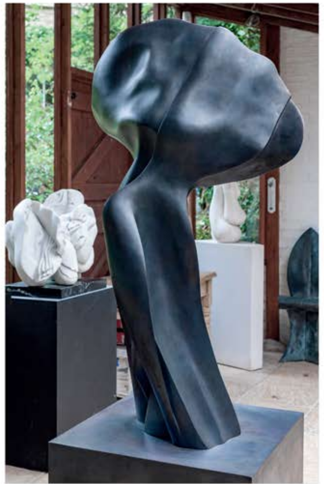
Homage 2018, bronze

While subject matter for Helaine Blumenfeld has grown from the figure through natural forms and abstraction, as well as her musings on history, mythology, challenges that face humanity and the formal matters of materiality in making sculpture, a feeling of the figure remains largely present, if abstruse. She creates some of her subjects in more than one material. For example, although most of the 'Exodus' series are made in bronze, two of their number are carved in white Statuario marble. The smaller Exodus: Metamorphosis 2016 is also at the heart of the monumental Metamorphosis at Wood Wharf; both are bronze casts, but with different patinas. At the heart of her 'Exodus' series is the notion of all themes in her work coming together, reflecting, she says, the world's chaos. Blumenfeld says that Illusion could also have been part of the 'Exodus' series as a chaotic group of three, being chaotic in unity.