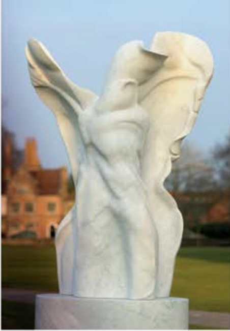
Mysteries 2011, marble