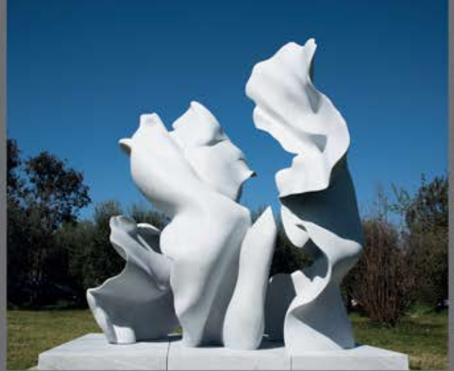
Taking Risks 2019, marble

Helaine Blumenfeld was born in New York in 1942. She studied Moral Philosophy at Columbia University, graduating with a PhD in 1964. She studied sculpture with Ossip Zadkine in Paris and had her first solo exhibition in 1966 in Palais Palfy, Vienna. There follows an impressively long list of exhibitions in Britain, Europe, Scandinavia, China, Korea, Singapore and the United States. She has had numerous commissions for art in the public realm and is represented in both private and public collections.