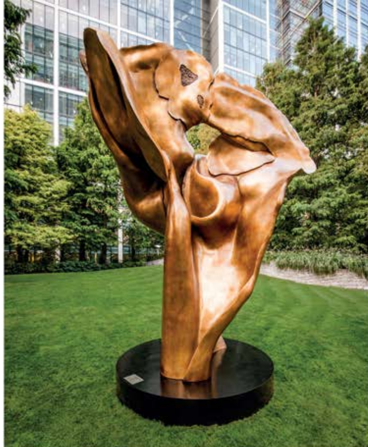
Fortuna 2016, bronze. Installed in Jubilee Park.

Should one of over twenty such small models satisfy her requirement - she is very, very self-critical - a larger piece is made and refined as a working model that may be further enlarged to a monumental scale, with still more refinements made before casting in bronze or carving in marble, stone or wood. The exhibition also features large terracotta pieces, worked by hand with great sensitivity to a fine surface.